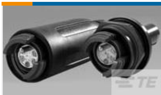
TE Part # 1374759-2 INSERT ASSY, 4XMM, MINI