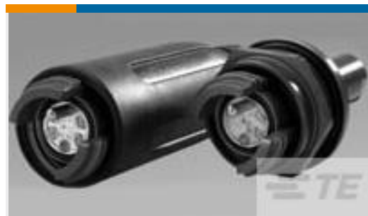
TE Part # 1374759-4 INSERT ASSY, 2XMM, MINI