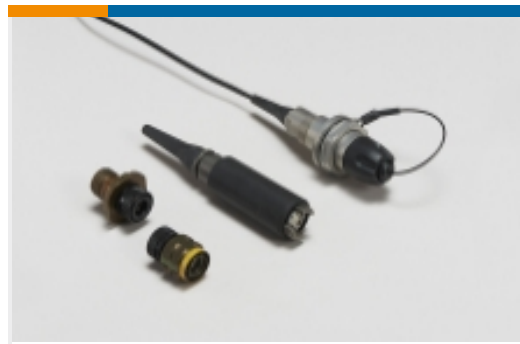
Expanded Beam Fiber Optics(9)