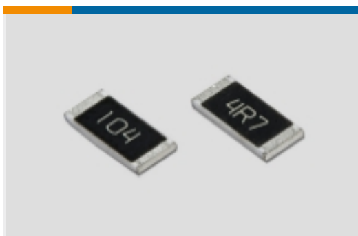
Surface Mount Resistors(545)